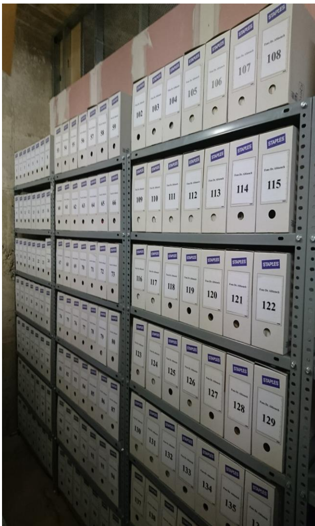
Detail of one of the current Archive shelves.